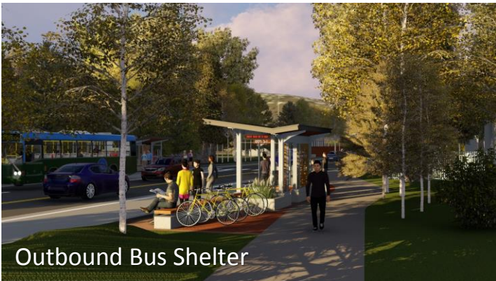
Outbound Bus Shelter