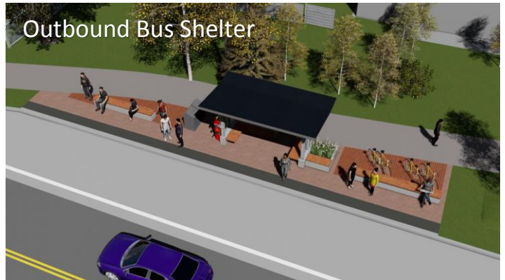
Outbound Bus Shelter