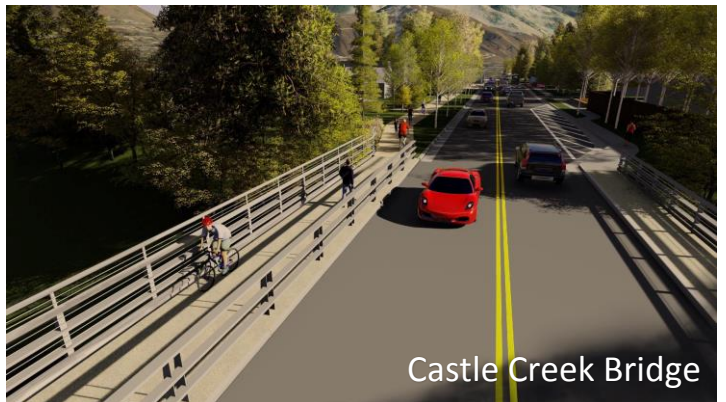
Castle Creek Bridge